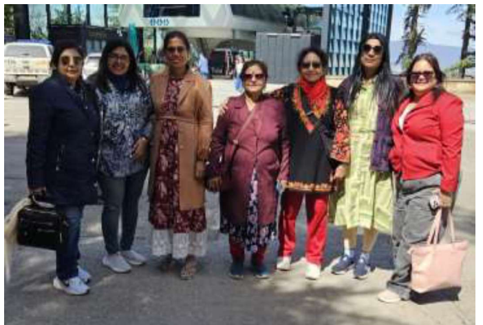
Rotarians from RCCJ and different other clubs of the district in Azerbaijan and Georgia